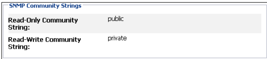
Figure 4 - SNMP Community Strings

Define the public and private community string.