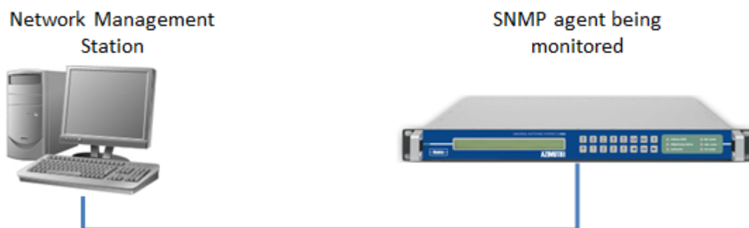
Figure 1 - SNMP Management System

This means that they have an SNMP agent that can be polled for information from a Network Management Station (NMS). The following figure presents the setup between an NMS and a device.